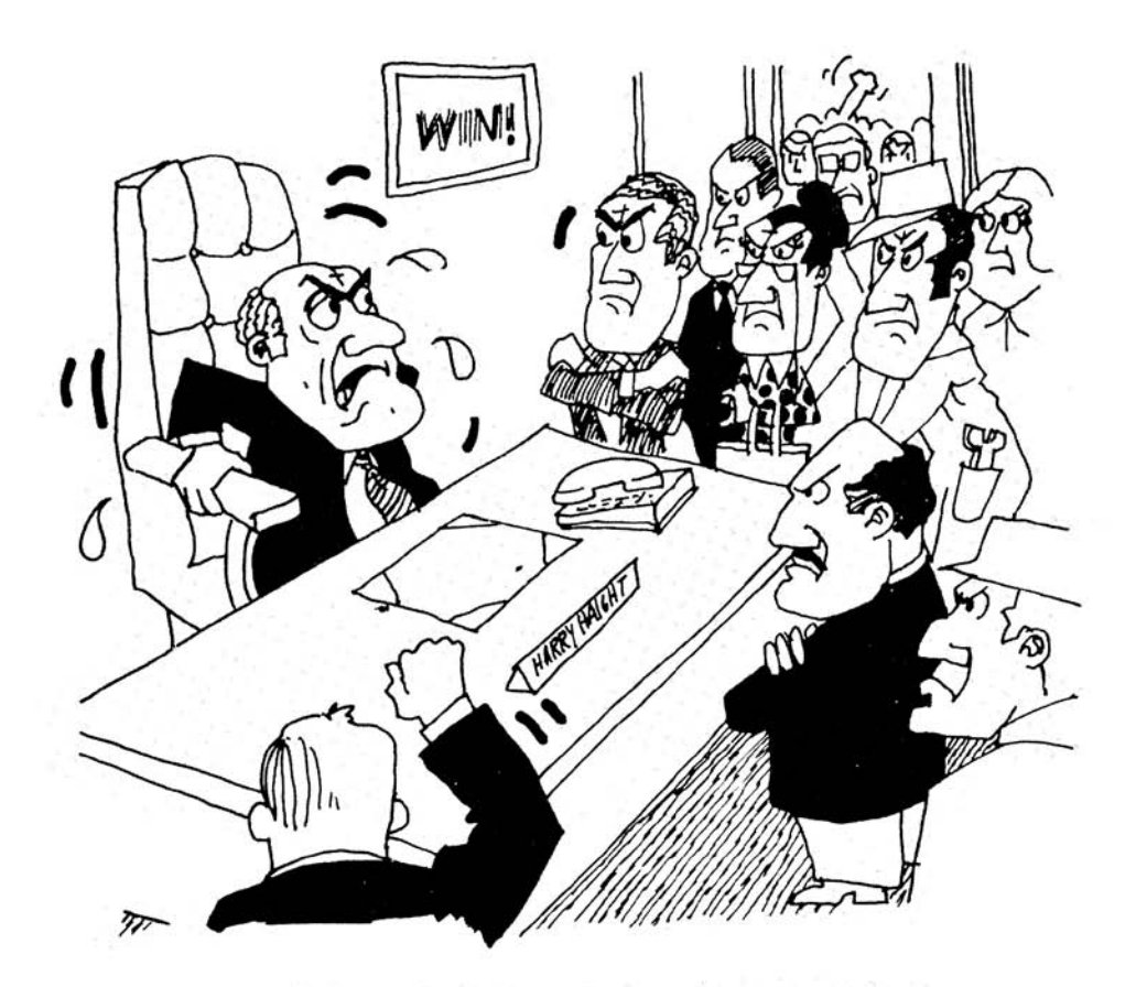
"WHAT IS THE MEANING OF THIS?" HARRY DEMANDED

H ARRY HAIGHT looked up as the oak door of his office burst open. His heavy jaw dropped as a dozen of his employees marched across his mink rug and menacingly surrounded his desk.